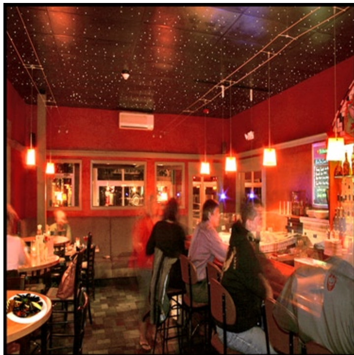
85 main - the bar