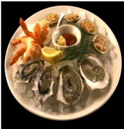
the essential raw bar platter

Our raw bar choices vary according to the season and availability. We typically stock three to four different oyster varieties alongside our littleneck clams and colossal shrimp cocktail. Whether you are an oyster aficionado or just curious about the hype, we welcome you to sample as many or as little as you like.