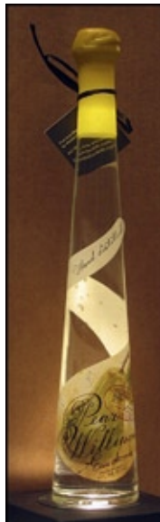
Pear William Eau-De-Vie