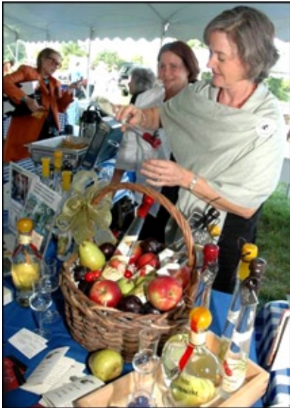
Eau-De-Vie made by Westford Hill Distillers from Ashford, Connecticut during a tasting.

Feel free to contact us for more information as these exciting events unfold!